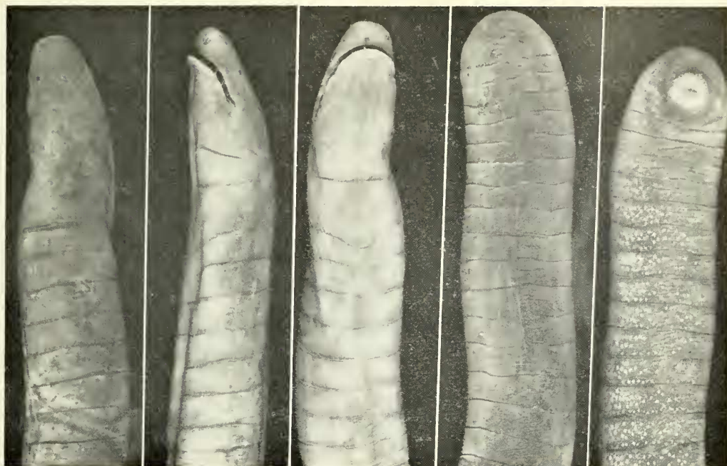
FIG. 1. Caecilia orientalis Taylor. Paratype. JAP 4553. La Alegría, Río Chingoac, "elevation 6248 ft." Dorsal, lateral and ventral views of head and neck region; dorsal and ventral views of terminal region.

only when it was very rotten, pulpy, and extremely wet.